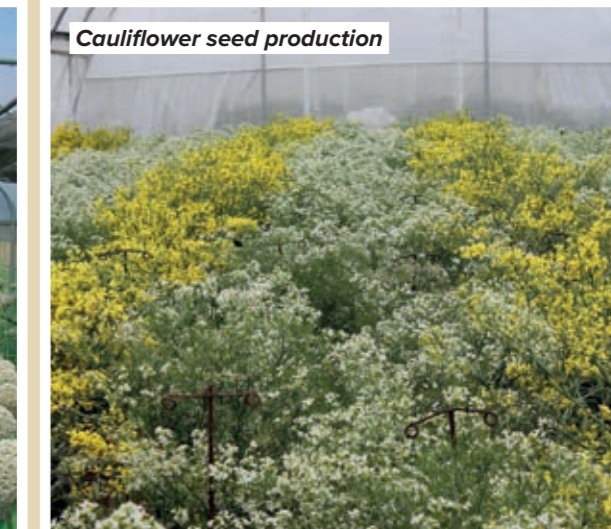
Cauliflower seed production