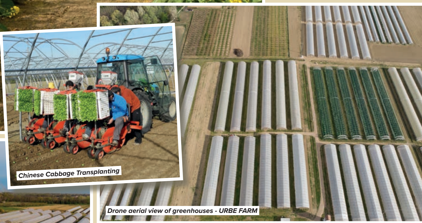
Chinese Cabbage Transplanting

A WHOLE AGRONOMIC TEAM SPECIALIZED IN HIGH-QUALITY SEED PRODUCTION