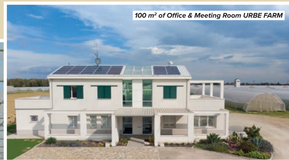
100 m 2 of Office & Meeting Room URBE FARM