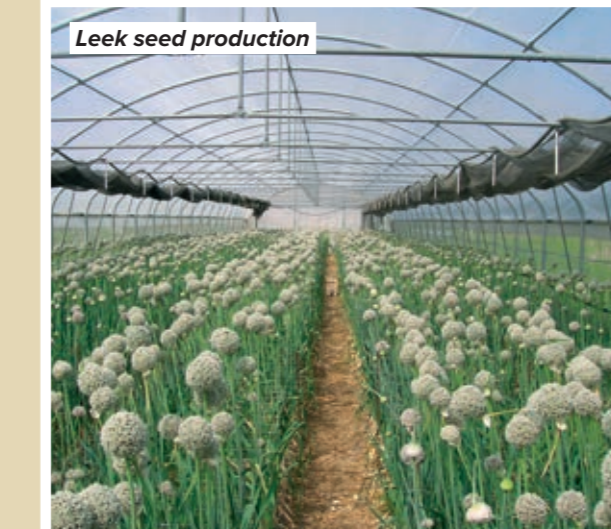
Leek seed production